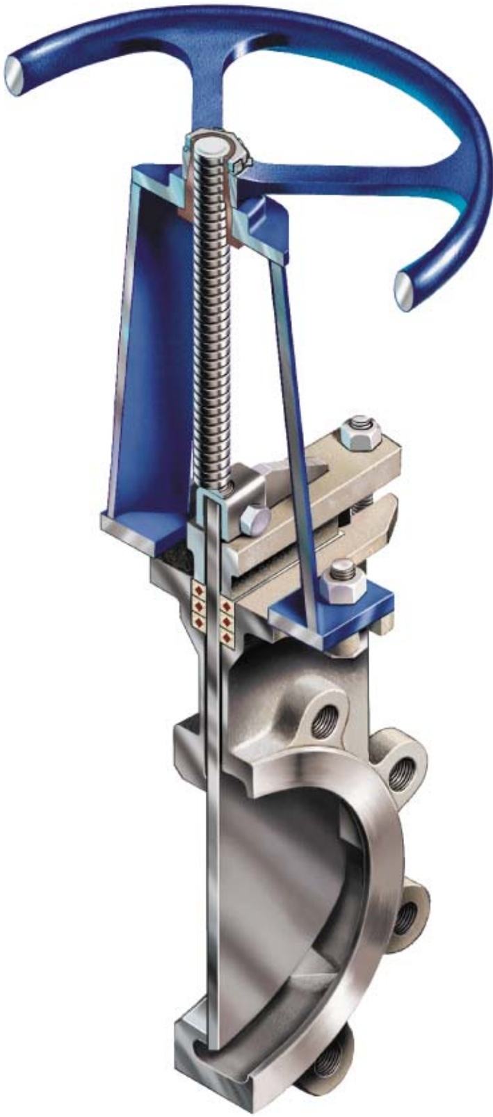
Figure C37 with energized cored packing.

Energized cored packing is standard with 6" (DN 150) and larger C37 valves and all F37 valves.